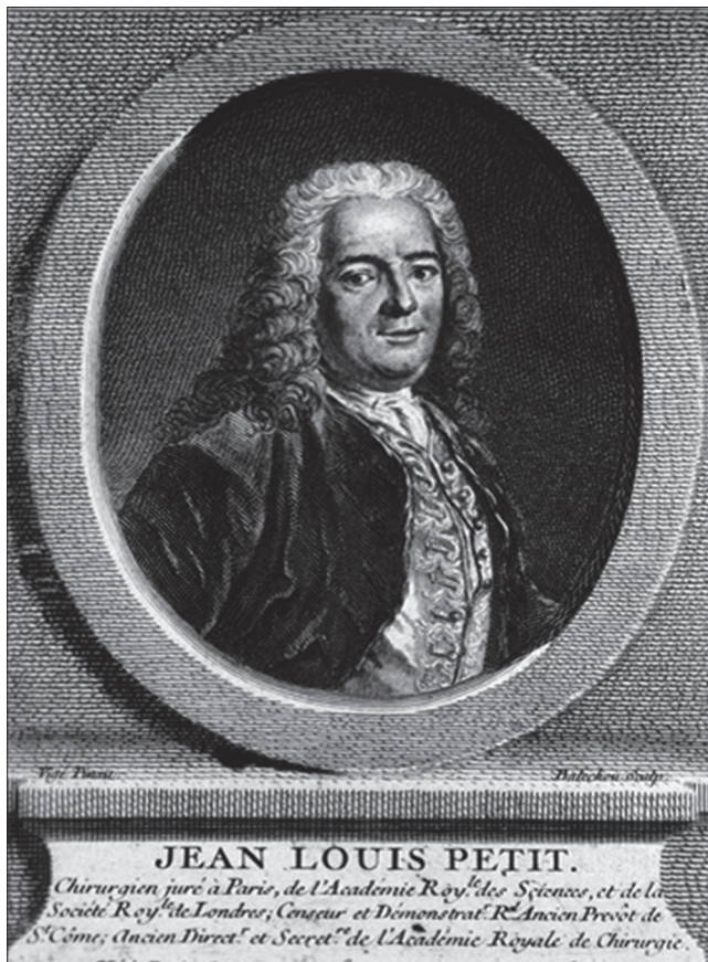
Figure 3. Jean Louis Petit (1674–1750). French surgeon who was the first to formally describe opening the mastoid, in a text published posthumously in 1774.

this period, he created a type of tourniquet for which he became famous. This was applied as a “screw tourniquet” and was used to contain hemorrhage before and after surgical procedures. Petit is credited with a level of expertise in mastoid surgeries unequalled in his time (17).