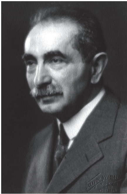
Figure 6. Gustave Bondy (1870–1954), Austrian surgeon (University of Vienna), popularized the modified radical mastoidectomy in which some or all of the middle ear structures were preserved in order to attempt to preserve hearing.

In order to release the purulent secretions confined within the antrum and the attic, Bondy removed the bone up to the external wall of the attic. He intended to preserve the tense part of the tympanic membrane and, if possible, the ossicles. A meatal skin flap was used to seal the defect between the epitympanum and mesotympanum; alternatively, when the ossicles were preserved, the flaps could be used to cover the exposed bodies (49-51).