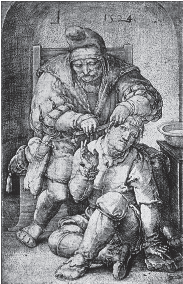
Figure 1. Early mastoid surgery as performed by a barber surgeon. Incision to drain abscesses has been practiced since ancient times. Lucas van Leyden, 1494–1533; The Surgeon , 1524.