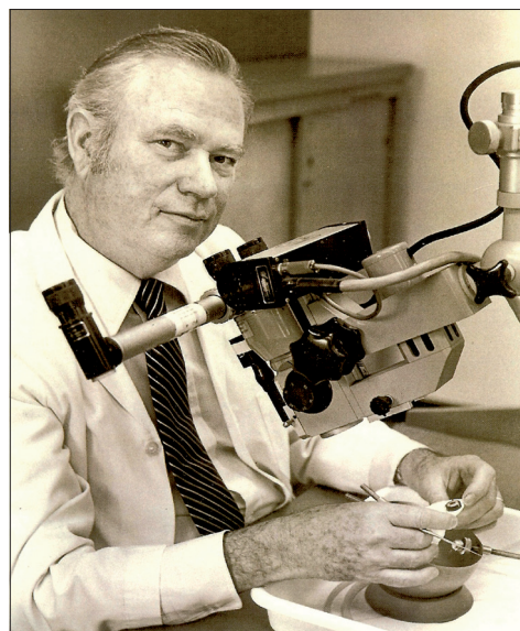
Figure 7. William House. American surgeon who introduced modern techniques of mastoidectomy and the use of mastoid access in otoneurosurgery.

Mastoidectomy continues to be a life-saving surgical procedure.