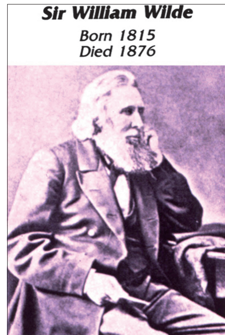
Figure 5. Irish surgeon who popularized the retroauricular incision.

Interest in mastoid surgery did not fade completely in the early 19th century. However, most surgeons performed mastoidectomy only in certain situations and for specific indications. In 1838, J. E. Dezeimeris wrote that reports describing complications due to mastoidectomies should be collected before the procedure was definitively