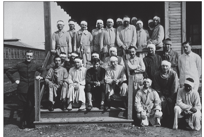
Figure 2. "Mastoid Club"—Picture from the time of the first World War illustrating how frequently mastoidectomies were performed. (Sander and colleagues, 2006).

The first documented surgical incision to drain an infected ear was described by the French physician Ambroise Paré in the 16 th century (8-11). Paré is credited with recommending drainage to François II, King of France, in 1560 (12). The king died of ear infection soon after; he did not undergo surgery because his mother, Catherine de Medicis, would not allow it (13).