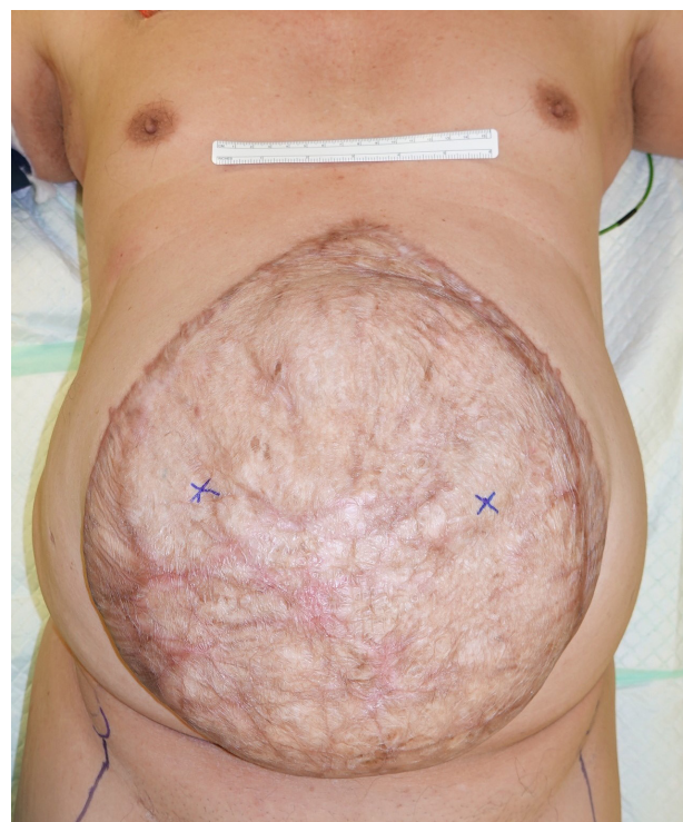
Fig. 1. An abdominal wall defect size of 35×32 cm.

We describe the use of tumescence for hydro-dissection and improving the safety margin when elevating skin grafts from the underlying bowel. This case is a 70-year-old male with a background history of diabetes mellitus and ischemic heart disease. He sustained polytraumatic injuries following a road traffic accident in 2018. His list of injuries included multiple rib fractures and a severe splenic injury complicated by abdominal compartment syndrome. An emergency laparotomy and splenectomy were performed followed by temporary abdominal closure. This was followed by several subse-