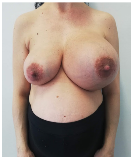
Fig. 1. Late periprosthetic breast seroma in a 40-year-old 25 weeks pregnant patient, suggesting for breast implant-associated anaplastic large cell lymphoma.

Fine needle aspiration was repeated during our first consultation and 50 mL of periprosthetic fluid sample was sent for cytological examination. Cell smear and cell blocks showed an infiltrate composed predominantly of large to medium-sized atypical cells with occasional mitotic figures and apoptotic debris in a fibrinous/necrotic background. By immunocytochemistry, the atypical cells were positive for CD30, CD4, IRF4, and negative for CD3, CD8, CD20, CD68, ALK (anaplastic lymphoma ki-