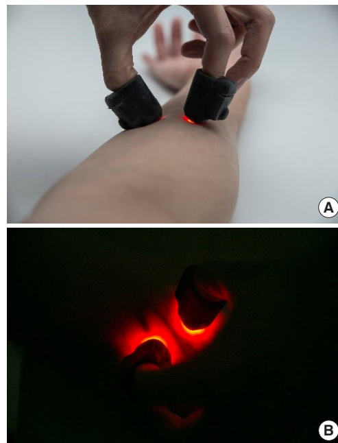
Fig. 1. The independent finger-mounted device. (A) Individual light sources conform to the contours of the forearm, channeling light for optimal vein visualization. (B) Vein over the forearm with branch points, visualized with two finger-mounted devices.

The study was approved by the Institutional Review