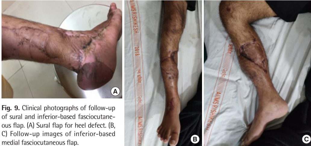
Fig. 9. Clinical photographs of follow-up of sural and inferior-based fasciocutaneous flap. (A) Sural flap for heel defect. (B, C) Follow-up images of inferior-based medial fasciocutaneous flap.

found in the distal third (66 cases), followed by the middle third (45 cases) and the proximal third (33 cases). However, they did not report correlations between the site of soft tissue defects and complications.