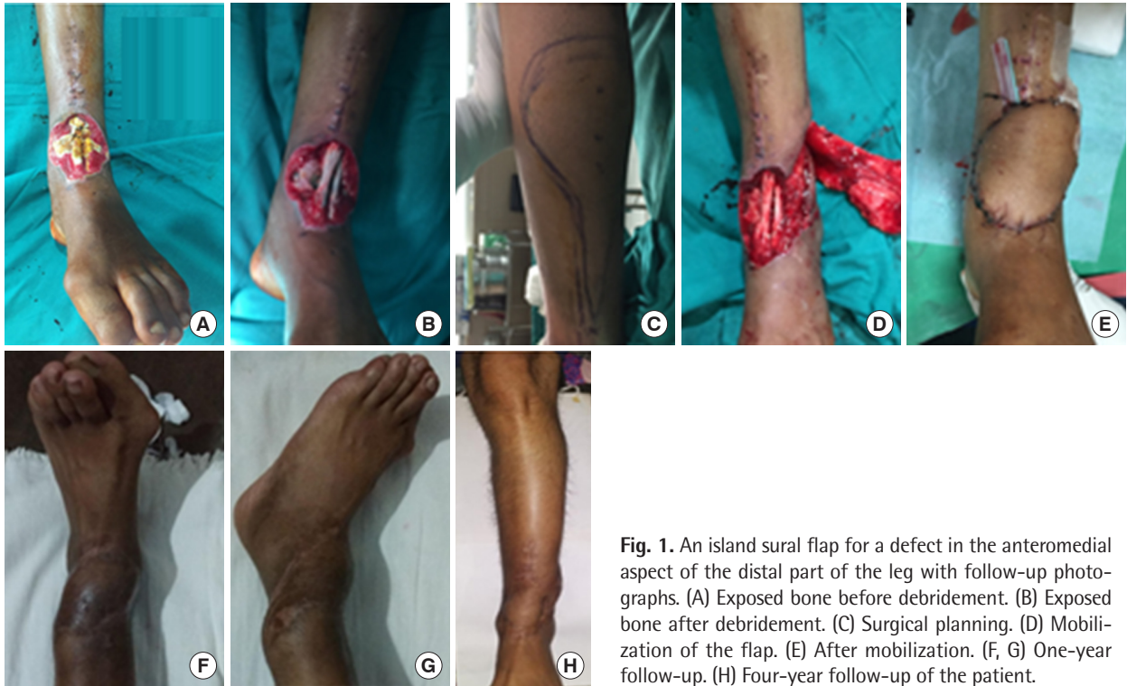
Fig. 1. An island sural flap for a defect in the anteromedial aspect of the distal part of the leg with follow-up photographs. (A) Exposed bone before debridement. (B) Exposed bone after debridement. (C) Surgical planning. (D) Mobilization of the flap. (E) After mobilization. (F, G) One-year follow-up. (H) Four-year follow-up of the patient.