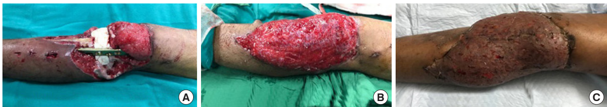
Fig. 6. A gastrocnemius flap for a defect in the proximal leg. (A) Raw surface after internal fixation. (B) Mobilization of the gastrocnemius muscle. (C) Skin grafting over the flap.

In our study, soft tissue defects were found in the proximal third of the leg in 39 cases (Fig. 6), the middle third in 40 cases, and the distal third in 46 cases (Figs. 7-9). In three cases, the middle and distal thirds were involved, and in one case, the proximal and middle thirds were involved. No statistically significant correlation was found between the defect site and complications ( P = 0.900 ). However, the anteromedial distal, anteromedial proximal, and anteromedial middle aspects, which accounted for 55 of the 138 cases, had somewhat more complications than the other sites. This can be partly explained because of the higher frequency of defects at these sites. In a study conducted by Kamath et al. [10], soft tissue defects were predominantly