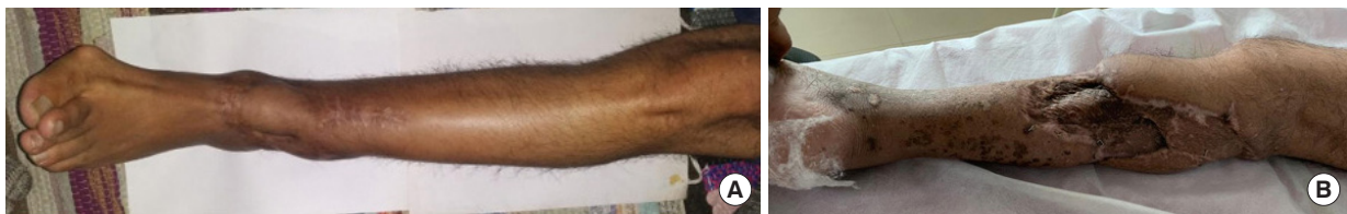
Fig. 7. Clinical photographs of follow-up of island sural flap for distal third of leg (A) and superior based medial fasciocutaneous flap (B).