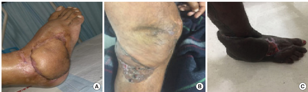
Fig. 8. Clinical photographs of follow-up of inferior-based lateral fasciocutaneous flap (A), superior-based medial fasciocutaneous flap (B), and sural flap for ankle defect (C).