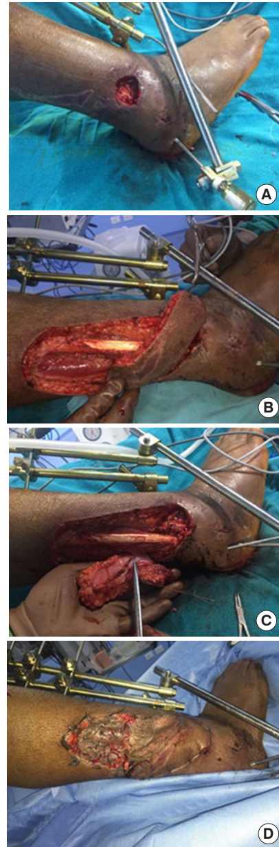
Fig. 5. A propeller flap for a defect in the lateral aspect of the distal leg. (A) Soft tissue defect. (B) Mobilization of the flap. (C) Surgical dissection and mobilization. (D) Coverage of the exposed bone and skin grafting.

Lower limb trauma is a rapidly-growing category of injuries worldwide as a result of road traffic and industrial accidents. Reconstructive surgeons are normally involved in lower limb trauma