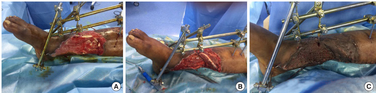
Fig. 2. A soleus flap for a defect in the distal part of the tibia. (A) Wound prepared for flap cover. (B) Soleus rerouted cover the exposed bone. (C) Raw surface left covered with a skin graft.