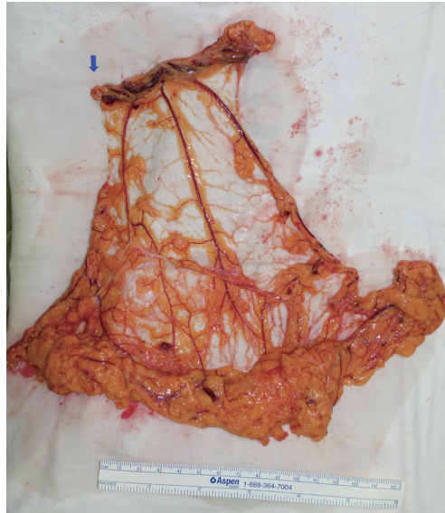
Fig. 4. Harvested omental flap. Right gastroepiploic artery and vein (blue arrow).

the groin or submental space, are used. The patient reported improvement in swelling 2–3 days postoperatively and demonstrated fewer episodes of cellulitis and pruritis, along with a reduction in limb volume by approximately 20%, at 85 days postoperatively (Fig. 1).