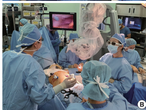
Fig. 3. (A, B) View of the operating room. With well-positioned displays and microscope, both plastic surgery and general surgery teams were able to operate without interfering with each other.

axilla, and the remnant omental tissue was inset in the lateral chest.