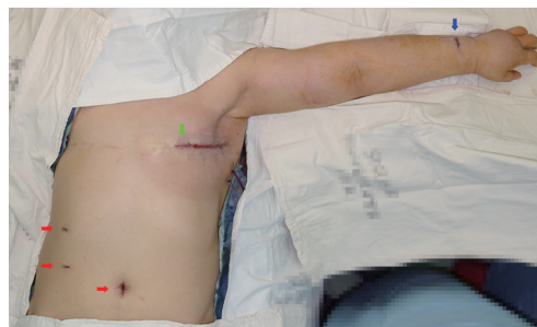
Fig. 2. Immediate postoperative image, illustrating draping and incision sites for lymphovenous anastomosis (blue arrow), vascularized lymph node transfer (green arrow), and laparoscopic omental harvest (red arrows).