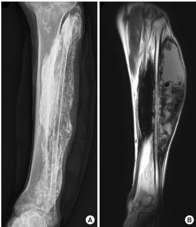
Fig. 1. Radiographs and magnetic resonance imaging findings. (A) Anteroposterior radiographs of the left lower leg showing extensive calcification of the tibialis anterior muscle, extensor hallucis longus muscle, extensor digitorum longus muscle, peroneus brevis muscle, peroneus longus muscle, and focal flexor hallucis longus muscle. (B) T2-weighted coronal magnetic resonance imaging view showing fluid collection with an intense signal in the upper area of the calcified muscles.

bony surface. Negative-pressure wound therapy (NPWT) was applied to reduce the size of the wound. However, primary closure was not possible due to the large defect site and the slow growth of granulation tissue. Free flap coverage was planned once MRSA was no longer found in the wound culture and the calcium debris was reduced during irrigation. A hand-held Doppler test and three-dimensional angiography showed that the left anterior tibial artery displayed poor perfusion, but the posterior tibial artery and peroneal artery were intact.