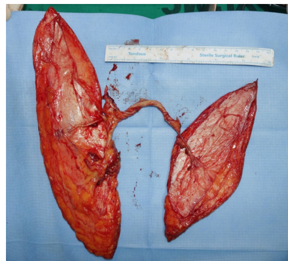
Fig. 3. Clinical photographs of intraoperative findings. The left thigh free flap (right side) measured 25 \times 7 cm 2 and the right thigh free flap (left side) measured 18 \times 8 cm 2 . The pedicle of the right thigh free flap was connected to the descending branch of the lateral circumflex artery of the left thigh. The combined flap was then harvested. The right thigh flap was de-epithelialized and positioned inside the cavity.