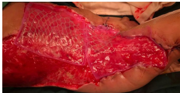
Fig. 3. Application of a cultured epithelial autograft with a widely meshed split-thickness skin graft at a 1:9 ratio after 3 weeks of debridement.