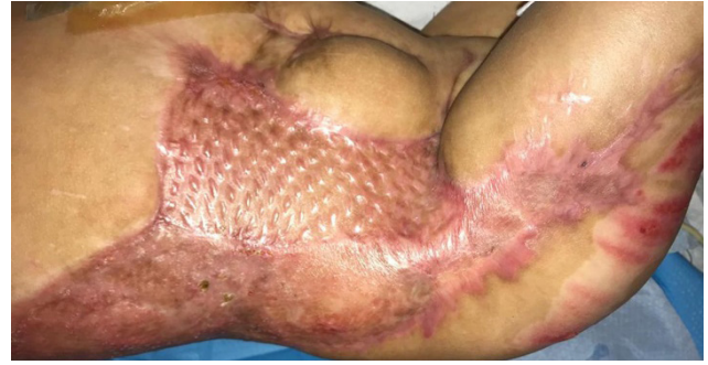
Fig. 7. One year post-surgery.

Purpura fulminans is a rare, rapidly progressive, and potentially fatal thrombotic disorder that typically affects neonates and children. Purpura fulminans may occur as a result of an acute episode of severe sepsis, following an acute systemic response for which there is systemic activation of the coagulation and complement pathways, as well as endothelial dysfunction. This pathological state is commonly known as disseminated intravascular coagulation, which is followed by microvascular thrombosis in the dermis and hemorrhagic infarction of the skin [1]. In this patient, the mainstay of treatment was full supportive care in the intensive care unit, treatment of underlying sepsis with broad-spectrum antibiotics, and early surgical excision of the