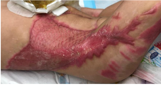
Fig. 6. Three-month postoperative, hypertrophic scarring over the thigh.

tient, the wound extended along the flanks to the thigh over the right hip joint. The patient developed hypertrophic scarring over the skin graft donor sites and the right thigh at the junction between the CEA and Integra application (Fig. 6). Interestingly, the anterior abdomen where CEA was applied with the meshed skin graft healed with minimal hypertrophic scarring (Figs. 6, 7). One year after resurfacing and conservative scar management, on the anterior abdomen where the CEA was applied with the extended mesh graft, the scar was soft and had a Vancouver Scar Scale score of 5 (Fig. 7). The scar outcome for the back, where Integra and the SSG were applied, showed a similar result, with a Vancouver Scar Scale score of 5 (Fig. 7). This is consistent with previous reports that have concluded that CEA with an expanded mesh skin graft yields scarring outcomes comparable to those of conventional skin grafting [10]. This also suggests that the scarring was comparable to the use of a conventional meshed skin graft with Integra, as indicated by Vancouver Scar Scale scores (Fig. 7). The hypertrophic scarring that developed at the junction between the CEA and Integra application improved with scar management techniques such as pressure garments and scar massage.