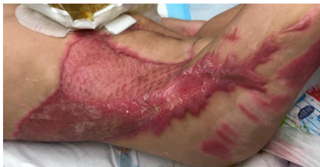
Fig. 6. Three-month postoperative, hypertrophic scarring over the thigh.