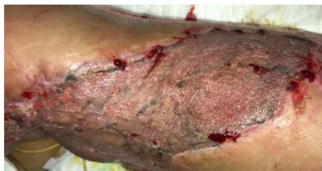
Fig. 5. The split-thickness skin graft on Integra well taken at 1 week.