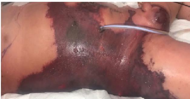
Fig. 1. Photograph of purpuric lesions. A homogeneous purpuric lesion affected 30% of the total body surface area.

Purpura fulminans developed in a 1-year-old infant secondary to enterocolitis sepsis after an uneventful laparoscopic endorectal pull-through procedure for Hirschsprung disease. Septic shock secondary to enterocolitis developed on the third postoperative day, requiring inotropic support and mechanical ventilation. Subsequently, an exploratory laparotomy was performed and a colostomy was created to decompress his digestive system. After laparotomy, he developed a purpuric lesion over the right anterior abdomen, flank, and lateral thigh (Fig. 1) affecting 30%