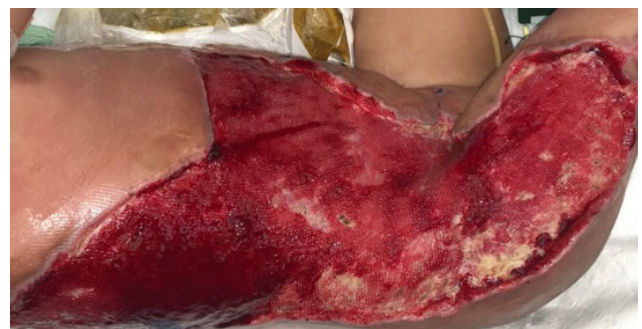
Fig. 2. Wound bed ready for grafting.

of his total body surface area. The histological diagnosis of purpura fulminans was confirmed based on a skin biopsy 5 days post-laparotomy. The affected areas were excised serially and debrided multiple times over a period of 3 weeks, leaving an extensive full-thickness wound exposing muscle and deep fascia (Fig. 2). On the second debridement (first week), a 2 × 2 cm skin biopsy was harvested for CEA in preparation for wound coverage. The wound was covered with a VAC dressing after every debridement for wound bed preparation, exudate management, and ease of nursing care. After a total of six serial debridements, the wound was deemed clean and ready for grafting (Fig. 2). At this time, four 10 × 10 cm sheets of CEA showed confluence, indicating readiness for application [5]. The CEA was applied together with a 6/1,000-inch autologous split-thickness skin graft (SSG) harvested from the right medial thigh and meshed to a 1:6 ratio of expansion as per the modified JACE technique described by Matsumura et al. (Fig. 3) [7,8]. The flanks and back were at higher risk of shearing and cell loss than the anterior abdomen, which is why we decided to limit the use of this technique to the anterior abdomen [9]. Consequently, Integra (Ethicon; Johnson & Johnson Medical, Norderstedt, Germany) was used as a resurfacing option for the flank and back. Integra is an artificial dermal substitute, which is a bilayer