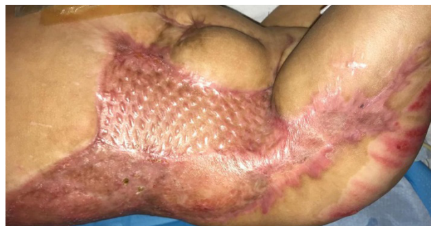
Fig. 7. One year post-surgery.

tient, the wound extended along the flanks to the thigh over the right hip joint. The patient developed hypertrophic scarring over the skin graft donor sites and the right thigh at the junction between the CEA and Integra application (Fig. 6). Interestingly, the anterior abdomen where CEA was applied with the meshed skin graft healed with minimal hypertrophic scarring (Figs. 6, 7). One year after resurfacing and conservative scar management, on the anterior abdomen where the CEA was applied with the extended mesh graft, the scar was soft and had a Vancouver Scar Scale score of 5 (Fig. 7). The scar outcome for the back, where Integra and the SSG were applied, showed a similar result, with a Vancouver Scar Scale score of 5 (Fig. 7). This is consistent with previous reports that have concluded that CEA with an expanded mesh skin graft yields scarring outcomes comparable to those of conventional skin grafting [10]. This also suggests that the scarring was comparable to the use of a conventional meshed skin graft with Integra, as indicated by Vancouver Scar Scale scores (Fig. 7). The hypertrophic scarring that developed at the junction between the CEA and Integra application improved with scar management techniques such as pressure garments and scar massage.