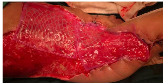
Fig. 3. Application of a cultured epithelial autograft with a widely meshed split-thickness skin graft at a 1:9 ratio after 3 weeks of debridement.