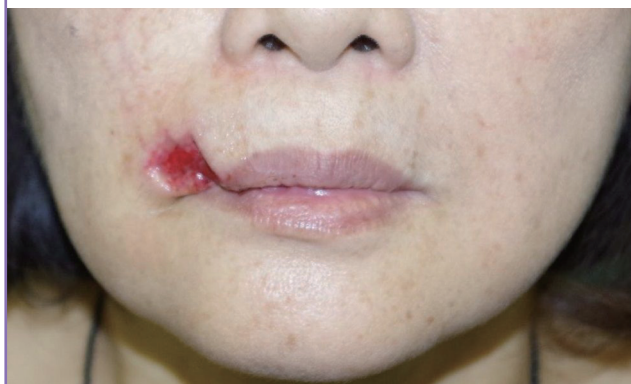
Fig. 2. Intraoperative findings

A 68-year-old woman was bitten by a dog, causing a defect of the right upper lip involving the white lip and the dry red lip. The defect measured 20 mm horizontally and 15 mm vertically. The wound was washed under local anesthesia, and an artificial dermis with a silicone sheet was sewn into place.