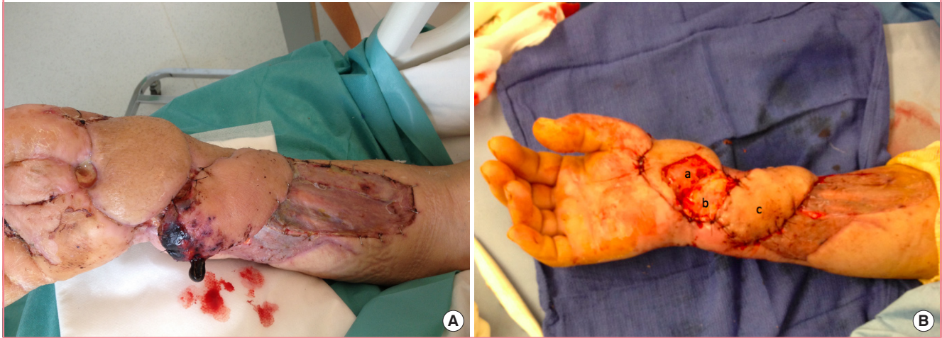
Fig. 3. Flip-flap puzzle flap for case 2

(A) Figure A shows the preoperative view of the patient's forearm with a distal necrosis of a radial collateral artery perforator (RCAP)-based perforator flap. (B) Figure B shows the immediate postoperative view of a flip-flap puzzle flap harvested from the interosseous posterior flap (a, donor site on the interosseous posterior flap; b, flip-flap puzzle flap; c, RCAP-based propeller flap).