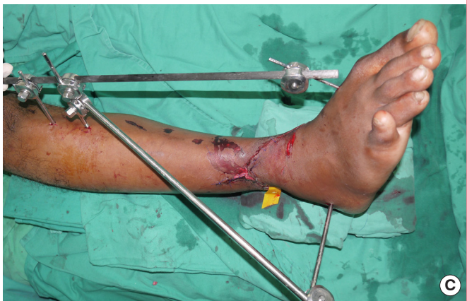
Fig. 3. Wound edge necrosis at 10 days post-replantation

(A) Wound necrosis demarcation. (B) The wound was debrided and covered with a free anterolateral thigh flap. (C) Good viability at 6 weeks after free flap wound coverage.