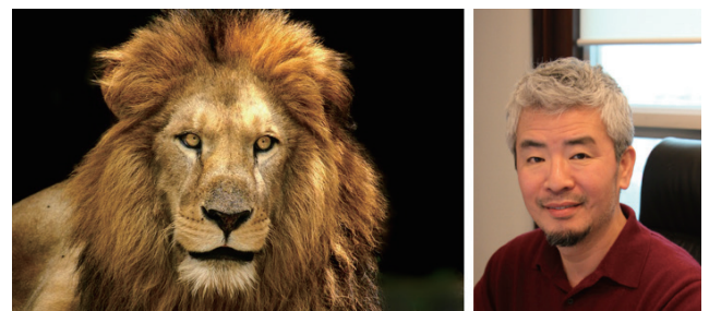
Fig. 3. A good grasp of the similarities and differences between the face of the lion and that of the human furthers expands the understanding of the human face.

When did life forms living in the sea begin to emerge into the land? We have not determined the exact time, yet when amphibians whose four feet evolved from the fin launched into the land, it means an unprecedented event in the history of life. The Mesozoic dubbed the Age of the Dinosaur saw the emergence of common ancestors to mammals. Mammals, surviving the great extinction in the Cretaceous Period, opened up an Age of Mammals, taking advantage of the extinction of the dinosaur. The small and weak common ancestors of mammals in the early stage were engaged in nocturnal activities at first, hiding from prying eyes of their predators and kept the body temperature constant thanks to being covered in fur. The vestiges of humans covered in fur leave their marks in the body of modern humans. The human body gets thin hair and is covered in sparsely scattered fur. Then, since when did hairs start to disappear from the face? Darwinist come up with changes that have taken place in the upper lip as a clue. Most of the mammals have their upper lips