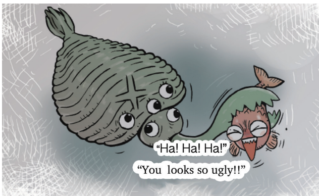
Fig. 2. Those face types of the opabinia became extinct. It is safe to say that universal features of the present animal phyla have passed the test of time 500 million years.

However, all creatures need to have the face. Plants do not have any forms of the face-the flowers of the sun flowers do not have the faces even though they are often referred to as the face metaphorically. Among animals, starfish, clams, sea anemone, and jellyfish do not have the face. Most of the faces of animals share some commonalities. The faces of lions, elephants and birds share some commonalities, as do the faces of fish and insects. Why is it that? The answer lies in the fact that the face is the product of the evolutionary process. The face consists of the mouth and sense organs. Two eyes, one nose and one mouth are aligned in a T-structure. And the order of the alignment never deviates. The face presumed to emerge during the pre Cambria Period is the result of forward movements in the ancient sea [6]. When an animal moves along, preceding parts become the face and then the momentum enables the mouth on the part to catch preys with ease [6]. More significantly, the preceding mouth makes incessant contacts with new objects. That is why sense organs predominantly concentrate on the face. The future of the ani-