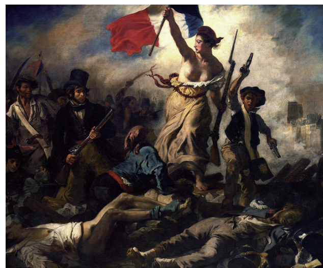
Fig. 1. La Liberté' Guidant le peuple, (Liberty Leading the People). The painting was rendered by Eugene Delacroix to commemorate the July Revolution in 1830. However, most people mistake this painting as “the face” of the French Revolution of 1789.

The face in Korean consists of two elements of eol (the soul or the mind) and gul a residing place). When Wittgenstein says “the face is the soul of the body,” his semantics corresponds to the Korean meaning. The meaning of the face in Korean is summed up in five ways. (1) the head or the front of the face with the eye, the nose and the mouth, (2) reputation or honor, (3) the general description of the psychological state, such as “the face of sadness”, (4) a figure person representing a particular area, such as “Sun Dong-yul is the face of the Korean baseball community,” (5) the primary imagery of the things and the event, such as “He is the face of the 4.19 Revolution.” As such, the word “face”, referring to a body part, extends its usages in a wide variety of contexts. What image do you convoke when you think of a person? With rare exceptions, you are most likely to invoke the face of the person. The face has come to be a byword for one's reputation or honor, and a pronoun for an expression of the essence of the thing and the event. This is presumably true of other languages. That is because human beings are equipped with the universal rule of language. A comprehensive understanding of the face is a must for cosmetic surgeons whose main responsibility is to sculpt and repair