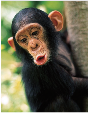
Fig. 4. The face of the monkey with the upper lip separated from the gum is one of the first steps in diverging from other mammals.