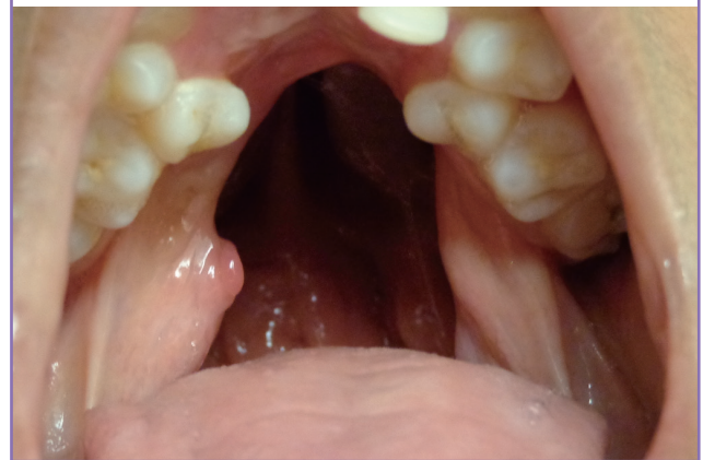
Fig. 2. Case 2: hard palate necrosis

A patient with bilateral cleft palate developed a large defect after primary palatoplasty at one year of age.