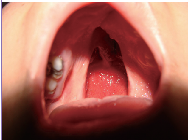
Fig. 4. Case 3: postoperative view of incomplete cleft palate case

A 24-year-old woman with isolated cleft palate classified as Veau 2, Randall 3, and severe palatal index (0.58) with a high TIL risk score of 9. TIL, type of cleft index of the cleft palate and length of the soft palate.