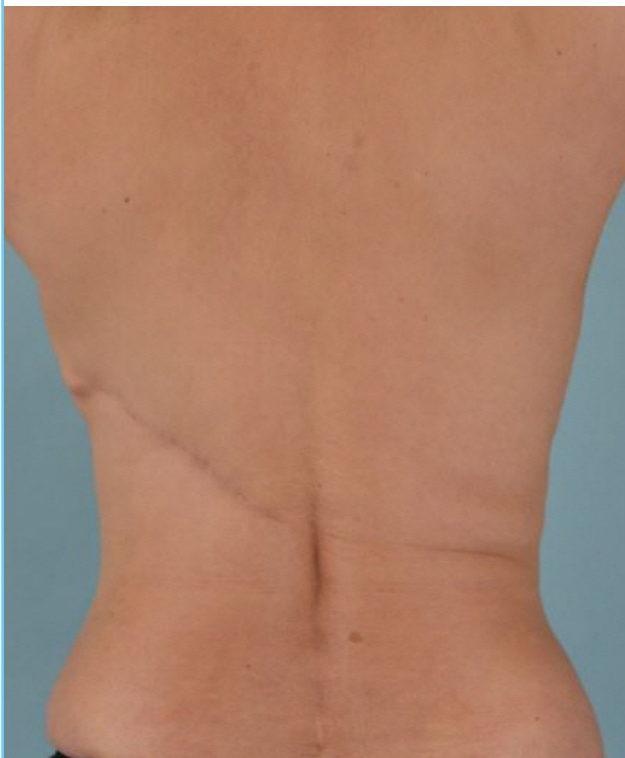
Fig. 2. Less visible scar on the donor site

A patient who was operated on without an elongated axillary incision line.