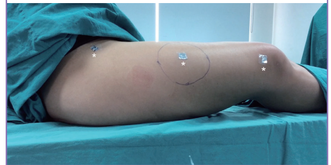
Fig. 1. Thermal camera setup

Aluminum foil marks (asterisks) are present in the anterosuperior iliac spine, the lateral patella, and the midpoint between them.