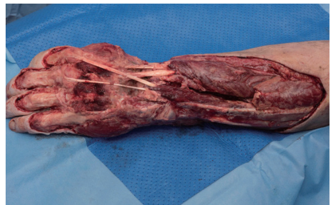
Fig. 2. Defect following debridement of necrotizing fasciitis: dorsal wrist and forearm with exposed carpal bones and extensor tendons zones III–VII.

This defect clearly required circumferential durable vascularized tissue cover at the wrist to cover the median nerve volarly and tendons and joints dorsally. Local and regional tissue transfer was not an option due to the extensive nature of the defect. An anterolateral thigh flap was planned, but no suitable perforators were found pre- or intraoperatively so an anteromedial thigh flap was performed. The flap was designed and raised to exactly fit the dorsal defect using a foam template. The fingers were temporarily syndactylised to allow the flap to cover the dorsum of all four fingers to the PIPJs. Fascial ex-