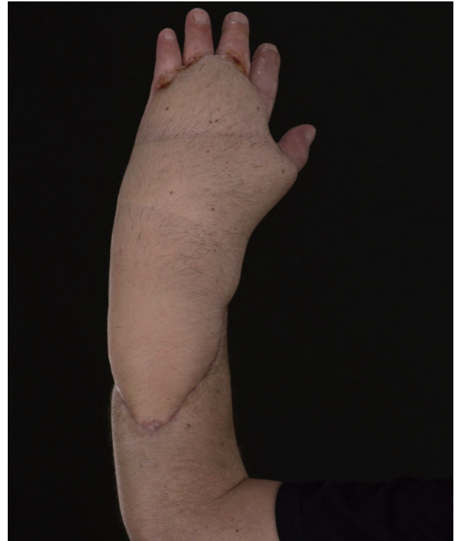
Fig. 4. Dorsal wrist and forearm three months postoperatively.