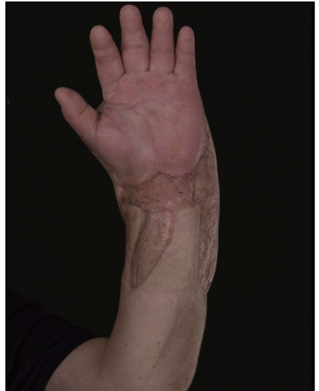
Fig. 5. Volar wrist and forearm three months postoperatively.