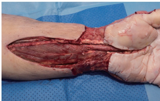
Fig. 1. Defect following debridement of necrotizing fasciitis: volar wrist and forearm with exposed median nerve and flexor carpi radialis tendon.

We read with interest the recent review of reconstructive options in upper limb circumferential defects “Soft tissue reconstruction of complete circumferential defects of the upper extremity”, by Ng et al. [1] published in May 2017. It is clear from the dearth of reported cases in the literature that this is a relatively rare, and severe, defect pattern with no clear consensus on the best method of reconstruction. The authors describe a number of grading systems of these injuries, including that by Tajima [2], which describes the depth of injury in relation to structures affected. The authors suggest a treatment algorithm for reconstruction of such defects based on aetiology. The authors correctly point out that in addition to size, choice of reconstruction must take into account volume, mobility, and pliability to maximise functional outcome [3].