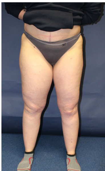
Fig. 1. Chronic stage II lymphedema in lower extremities