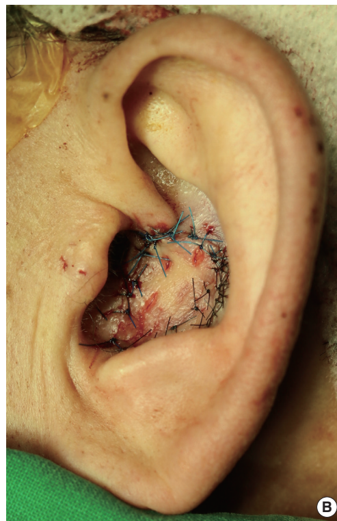
Fig. 2. (A) Intraoperative photograph; the seborrheic keratosis within the left cavum concha, extending into the external auditory meatus, was completely excised. (B) Postoperative photograph after excision, showing the defect site reconstructed with a full-thickness skin graft.