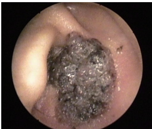
Fig. 1. Otoscopy reveals a blackish papillomatous lesion within the left cavum concha, extending into the external auditory meatus.

The patient provided written informed consent for