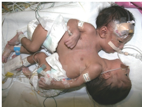
Fig. 1. A 13-day-old thoraco-omphalopagus conjoined twins who shared the heart and the liver.

Conjoined twinning is one of the most uncommon congenital anomalies. Spencer has reported that while the incidence of conjoined twinning is close to