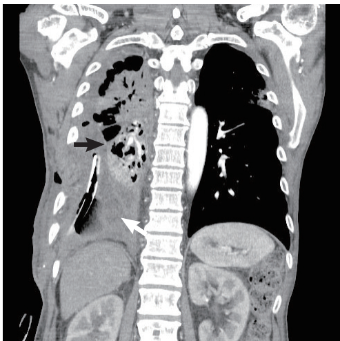
Fig. 5. Two weeks postoperatively, a chest computed tomography scan shows the pleural space filled by the intrathoracic transposition of the latissimus dorsi muscle flap (white arrow). A chest computed tomography scan of the right upper lobe shows pneumonia (black arrow).

adduction, and internal rotation of the shoulder joint, it does not function independently. Since it moves in synchrony with a number of synergistic shoulder girdle muscles, the LD muscle can be sacrificed safely without affecting shoulder or arm action [5].