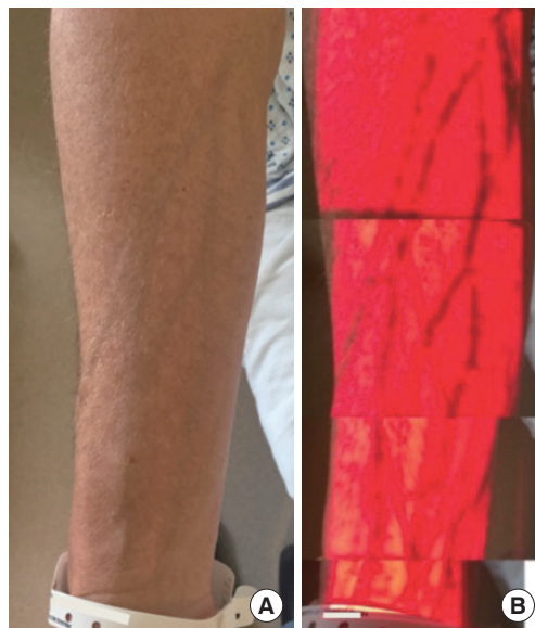
Fig. 1. (A, B) Hand-held vein visualization device, (AccuVein) uses a red laser and infrared laser to illuminate basilic and cephalic venous vasculature for the forearm.

The AccuVein was used on ten patients. In eight patients at least one SIEV was identified preoperatively in all patients and there was 100% positive and negative correlation of preoperative markings with intraoperative exploration (Fig. 3), and all veins were able to be identified intraoperatively. In the other two patients had abdominal striae that interfered with venous imaging and abdominal veins were not able to be visualized. In two patients preoperative vein mapping changed the flap design: the inferior incision was lowered to explore the vein before it bifurcates to include a larger caliber vessel in the flap for flap drainage or when patients were possible SIEA flap candidates. There were no AccuVein related complications and no false