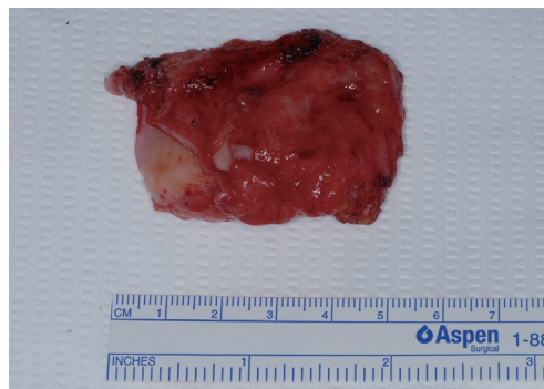
Fig. 2. A white mass measuring 4 cm × 5 cm and composed of a fibrotic component.