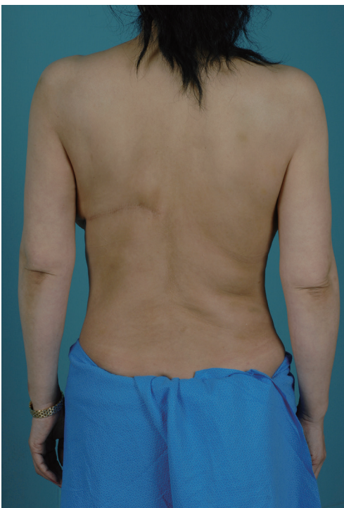
Fig. 1. Back view of a patient who underwent breast reconstruction with an extended latissimus dorsi flap. Patient complained of a palpable mass with stabbing pain in her donor site.

A wide excision with clear margins has long been accepted as the first-line treatment modality. Although a free resection margin is associated with a low rate of recurrence, there remains controversy about the amount of tissue that needs to be resected. Furthermore, the complications of wide tumor