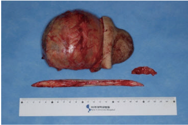
Fig. 3. The 11 cm × 11 cm × 10 cm-sized mass was completely excised. The mass was encapsulated by fibrous cyst.