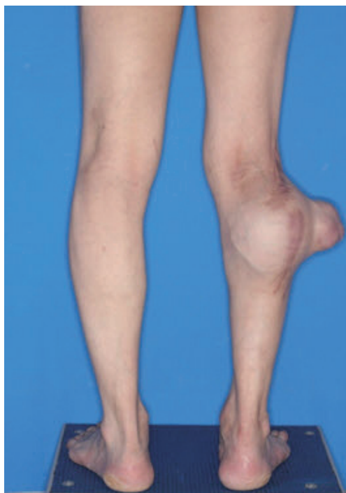
Fig. 1. Preoperative photograph.

Ancient hematoma is one of several lesions that require differentiation from soft tissue neoplasm. This hematoma, named as such by Mentzel et al. [1], is a benign soft tissue tumor surrounded by a fibrous pseudocapsule with inflammatory cells present inside