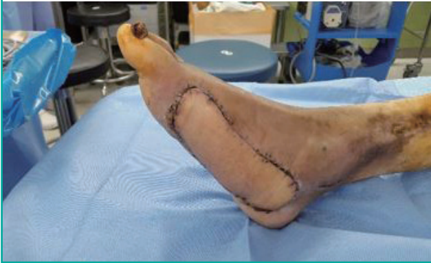
Fig. 6. Preoperative photograph

The flap was well maintained 2 months after surgery, without any postoperative complications.