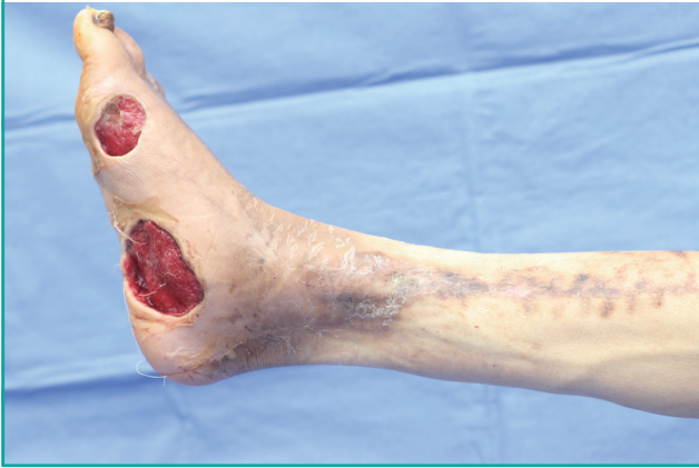
Fig. 2. Intraoperative photograph

Preoperative photographs showing the ulcers of the patient after debridement. Medial side.