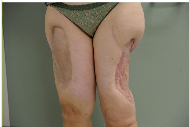
Fig. 7. Left thigh second reconstructive attempt

The patient's left thigh had a good functional outcome upon discharge (PID#54) to a rehabilitation center but the aesthetic result was unsatisfactory with split-thickness skin graft coverage.