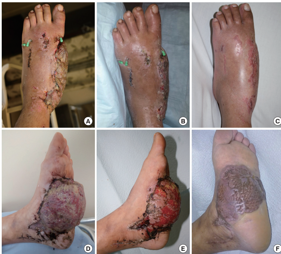
Fig. 3. Comparison between flaps with VAC and open dressings

Comparison between flaps with VAC and open dressings in the foot treated with immediate postoperative VAC dressing (Group 1; A–C) and wet to dry dressings (Group 2; D–F). Free latissimus dorsi flap to left foot (Group 1) at postoperative day 7 (A), 21 (B) and 4 months (C). Flap is not bulky after VAC dressing is taken down and has achieved its final thickness at 4 months postoperative. Free serratus anterior flap to left foot (Group 2) at postoperative day 14 (D), 1 month (E) and 8 months (F). Flap remains bulky in the immediate postoperative period and does not atrophy until 8 months postoperatively. VAC, vacuum assisted closure dressing.