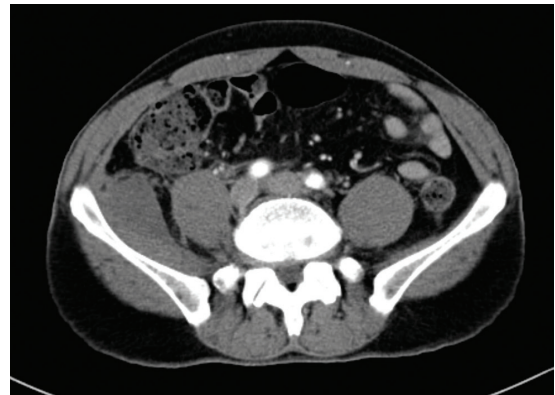
Fig. 4. A computed tomography (CT) image shows the regression of the hematoma. After 7 days, a CT image shows the regression of the hematoma of the right iliacus muscle.

the patient complained of sudden pain in the right flank. The pain was sudden in onset, was severe, and did not respond to analgesics, but femoral neuropathies such as muscle weakness, paresthesia, and paralysis were not present. Although the patient's vital signs were stable, a laboratory test showed that the hemoglobin levels had dropped from 11.6 to 10.1, and then to 9.6 g/dL, within 12 hours. The leukocyte count was normal (7,800–9,520 mm 3 ) and aPTT was delayed at 98.8 seconds. The computed tomography (CT) scan of the abdomen revealed an 8 cm × 3.6 cm hematoma of the right iliacus muscle combined with perilesional fluid collection and the widening of the retroperitoneal space and anteromedial displacement of the psoas muscle (Fig. 3). Fortunately, the hematoma was determined to be non-active bleeding