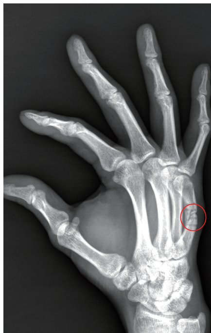
Fig. 2. Preoperative X-ray of the second fracture event. The X-ray shows refracture and hole-defects of the fifth metacarpal bone shaft of the left hand (red circle).