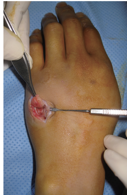
Fig. 4. Intraoperative clinical photo. The mass is located just above the screw holes.