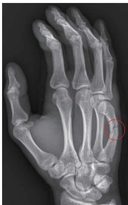
Fig. 1. Preoperative X-ray of the first fracture event. The X-ray shows the fracture of the fifth metacarpal bone shaft of the left hand (red circle).

A 30-year-old male visited Bucheon St. Mary's hospital with a swelling on his left hand after a slip-and-fall injury. He was diagnosed with a left fifth metacarpal bone fracture by hand computed tomography (CT) and X-rays (Fig. 1). The first operation was performed 8 days after the injury, and open reduction was performed. To stabilize the fracture segments, a bioabsorbable plate and screws (Linvatec Biomaterials Ltd., Tampere, Finland) were used for internal fixation. Although the 1-year follow-up was uneventful, the patient visited us with swelling on the previous operation site. Physical exam showed just the swelling of the soft tissue of the operation site without any fluctuation, heat, or erythema. We recommended further evaluation such as an imaging study, but the patient refused to undergo it. Therefore, we decided to observe the patient without administering any medication because there was no evidence of infection. Four months later, the patient visited us again because of another trauma at the same site. Physical examination, CT, and X-rays were conducted, and the patient was diagnosed with a refracture of the fifth metacarpal bone with increased soft tissue swelling as compared to when we first noticed it 4 months previously (Figs. 2, 3). We