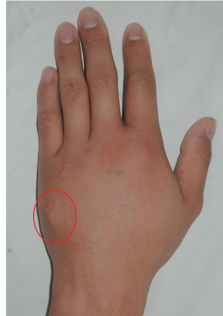
Fig. 3. Preoperative clinical photo of the second fracture event. Soft tissue swelling can be seen without signs of infection (red circle).

who were treated with bioabsorbable implants for metacarpal fractures required a second operation because of a foreign body reaction. However, all of