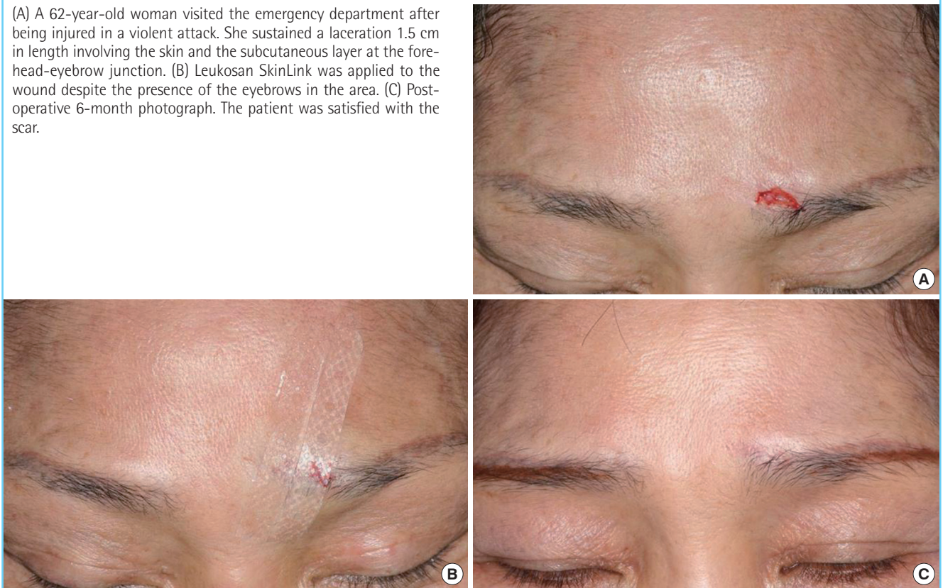
Fig. 4. Patient case II

(A) A 62-year-old woman visited the emergency department after being injured in a violent attack. She sustained a laceration 1.5 cm in length involving the skin and the subcutaneous layer at the forehead-eyebrow junction. (B) Leukosan SkinLink was applied to the wound despite the presence of the eyebrows in the area. (C) Postoperative 6-month photograph. The patient was satisfied with the scar.