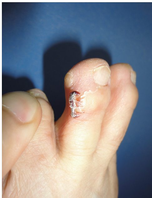
Fig. 1. Preoperative clinical view. 72-year-old female patients visited our hospital with chief complaint of 1 cm sized round and protuberance skin lesion which had a indetermined margin on dorsolateral aspect of third toe on left foot.

On histopathologic examinations, the patient was diagnosed with chondroma characterized by the