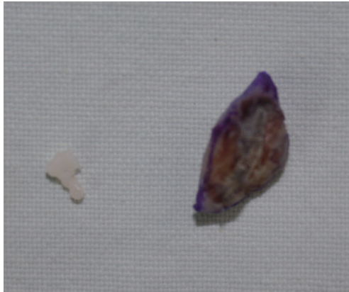
Fig. 3. Including calcified lesion, 1.0 x 0.8 cm sized mass excision was performed.