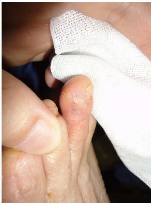
Fig. 5. Postoperative clinical view. 1-year follow up after operation shows no other complications nor recurrence signs.