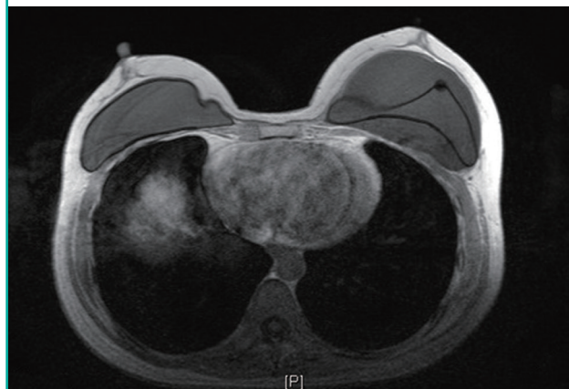
Fig. 2. Ruptured implants

An example of an magnetic resonance imaging of a ruptured silicone implant.