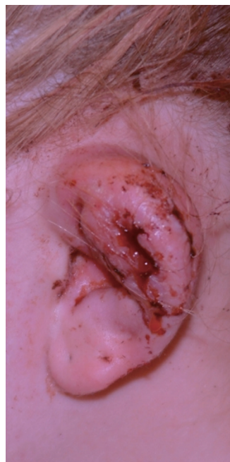
Fig. 1. Profile view of the infected ear at presentation.

Ear cartilage piercing has skyrocketed in popularity among teenagers and young adults [1]. In this lay procedure, the upper cartilage of the ear, the scapha, or the most lateral cartilage, the helical rim, are pierced with either a hollow-core or solid core instrument and jewelry is placed through the hole. While piercing