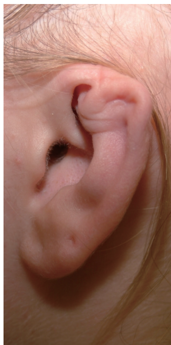
Fig. 2. Profile view of deformed ear one year post infection.

Although the cosmetic deformities associated with cartilage piercing were described over 30 years ago, the recent surge in popularity calls attention to its dangers. Approximately a third of college students have some sort of body piercing, excluding ear lobes [2]. Ear cartilage piercing comprises over half of all body piercings and associated complications are underestimated because these infections are not reportable to public health entities. However, it is known that the incidence of perichondritis has increased and has been shown to have a greater risk of infection than earlobe piercing [3]. Unfortunately, cartilage ear piercing is often performed in a non-sterile environment by unqualified individuals that are unaware of potentially devastating consequences.