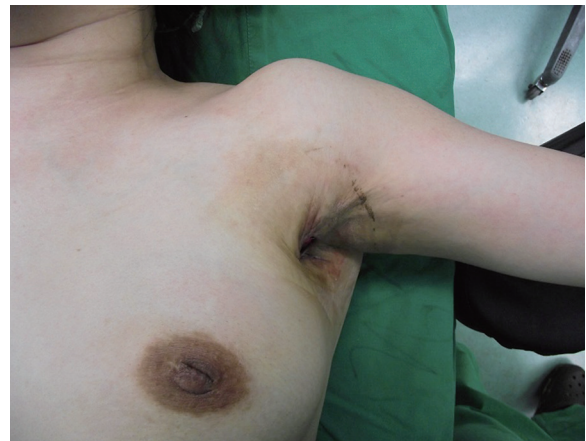
Fig. 1. Limitation of motion of left shoulder due to scar contractures is shown. Checked active range of motion is about 70 degrees.

Infection after augmentation mammoplasty should not be underestimated. Because if not appropriately treated, it may lead to serious issues such as scarring, wound dehiscence, reinfection and after all, implant loss [1,2]. Generally, even if in severe infection, the course tends to improve with implant removal, antibiotic treatment and other additional surgical procedures like debridement, drainage [2]. But with above treatments it may lead serious secondary complications [2] and we experienced about axillary fistula and scar contracture with limitation of motion