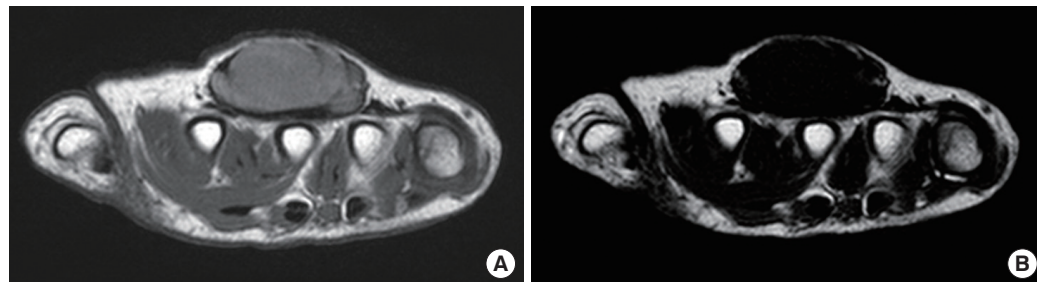
Fig. 2. (A) A T1-weighted axial image shows a lobulated mass with intermediate signal intensity, adjacent to the extensor digitorum tendon. (B) A T2-weighted axial image shows a mass with dark signal intensity.