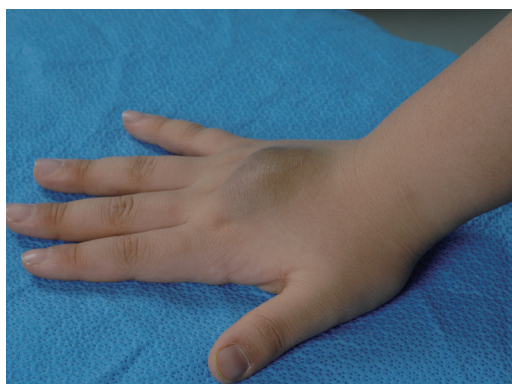
Fig. 1. Preoperative clinical photograph of the patient's hand.

GCTTS is a slow-growing soft tissue mass that