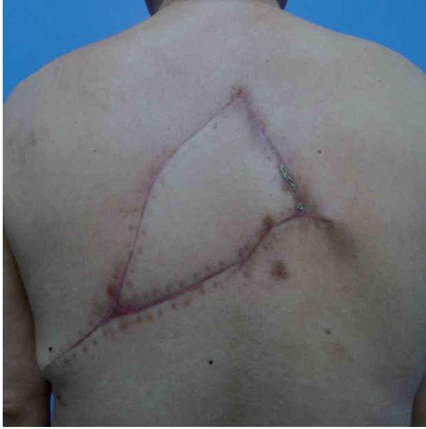
Fig. 5. Postoperative two months, postoperative course was uneventful.