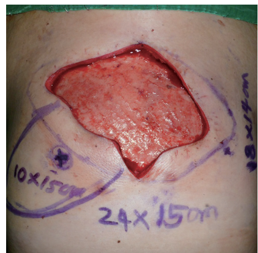
Fig. 2. Preoperative photo, defect size was 18 × 14 cm and size of the undermined area was 24 × 15 cm.

Using 3.5 × loupe magnification, careful suprafascial