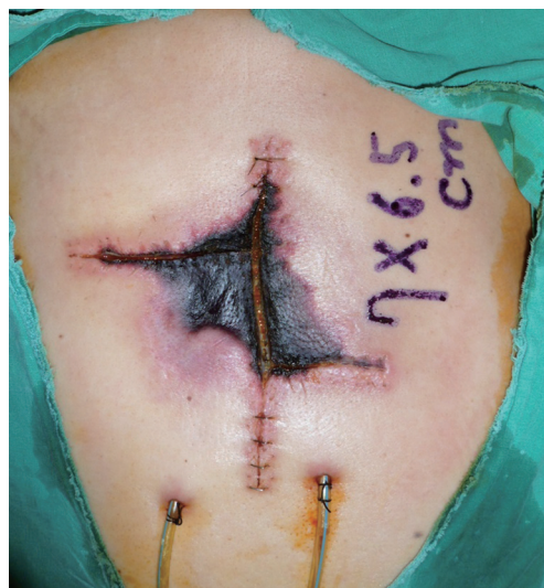
Fig. 1. Initial photo shows skin necrosis measuring 7 × 6.5 cm in size on the upper and mid-thoracic area.

Soft tissue defects of the posterior trunk may be presented after radiation injury, chronic pressure sores, spina bifida, dehiscence with exposure of spinal stabilization devices, and postoperative wound infection, etc. [1]. According to the location, it can be divided into four anatomic territories; posterior cervical, upper thoracic, mid-thoracic, and lumbar