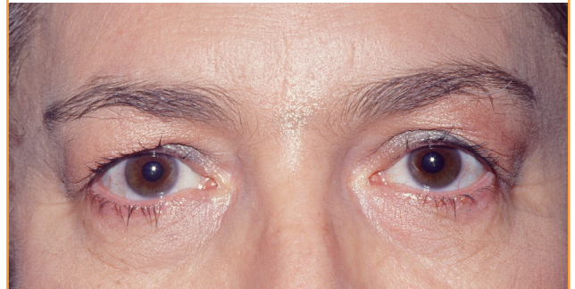
Fig. 8. Postoperative left-right comparison

Before photograph of a 71-year-old patient undergoing bilateral upper blepharoplasties. Skin-only excision was randomly assigned to one eyelid and muscle-sparing excision randomly assigned to the other lid.