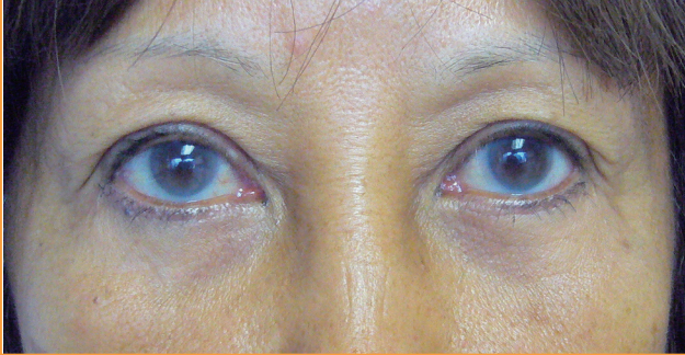
Fig. 6. Postoperative left-right comparison

Before photograph of a 58-year-old patient undergoing bilateral upper and lower blepharoplasties. Skin-only resection was randomly assigned to one upper eyelid and muscle-skin resection assigned to the other lid.