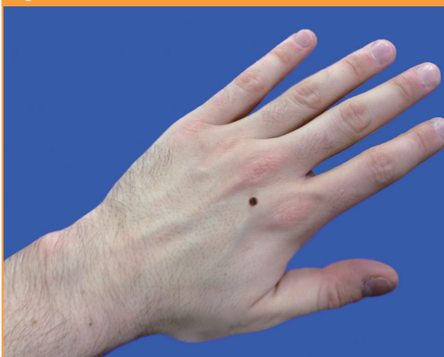
Fig. 1. Circular lesion on the dorsum of the left hand