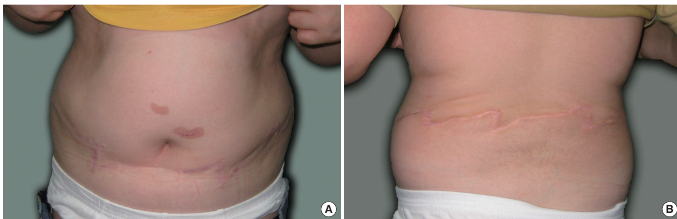
Fig. 2. Postoperative view. (A) Anterior view of the patient. (B) Posterior view of the patient.

were above the pelvic rim, and the circular abdominal band was extremely rare [4].