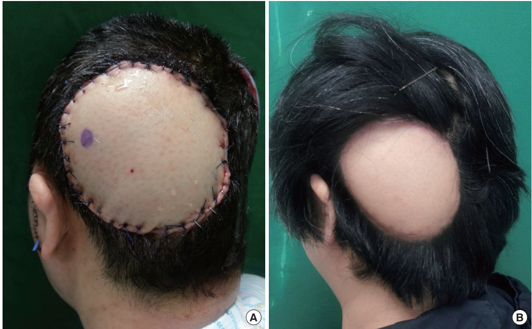
Fig. 4. Postoperative findings. (A) Photograph at 3 days after the operation. (B) Follow-up photograph at 8 months after the reconstruction. The photograph shows an aesthetically pleasing contour and no recurrence.

may even extend intracranially, causing a high degree of morbidity and possible mortality. Local recurrence after excision is frequently seen [2]. Therefore, the authors decided to perform a wide full-thickness excision of the tumor, which subsequently required free flap coverage. Options for scalp reconstruction include the use of local flaps, tissue expansion, or free flaps [3]. It is generally accepted that the best replacement for scalp tissue is adjacent tissue because there is no other donor site on the body that can match the hair-bearing qualities of the scalp. Therefore, local flaps are the optimal choice for the best cosmetic effect. However, in the event of extensive scalp defects, where local tissue rearrangements are inadequate for reconstruction, the use of local flaps is limited [3].