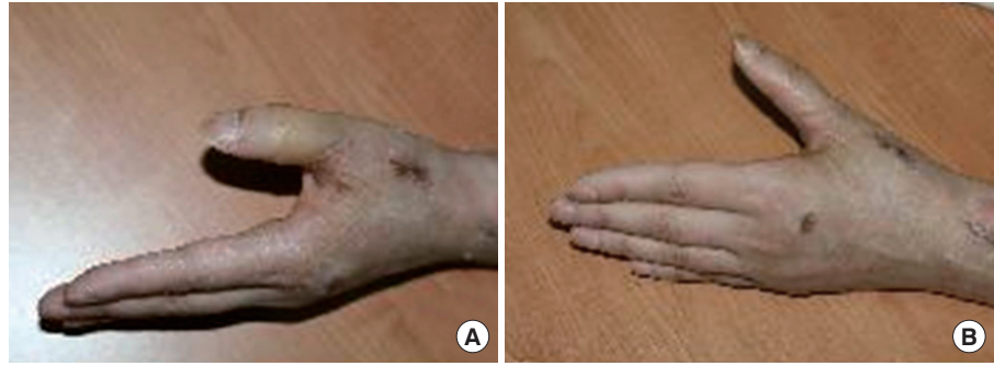
Fig. 4. Postoperative view. (A) Flexion was slightly limited. (B) The extension of the interphalangeal joint of the thumb was fully recovered.

precipitated the spontaneous rupture of the EPL tendon without other predisposing risk factors. Zvijac et al. [5] reported that the EPL tendon could spontaneously rupture due to attrition of the tendon around Lister's tubercle.