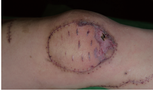
Fig. 3. Appearance of the flap 2 months after the operation.