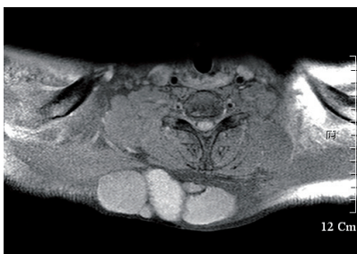
Fig. 1. Magnetic resonance imaging findings (T1 fat suppression image) of five epidermal cysts.