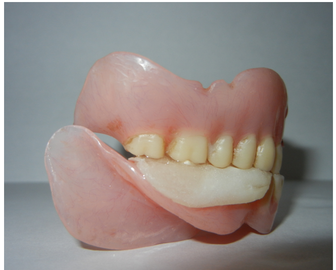
Figure 4. The 3 unit modified mandibular advancement device.