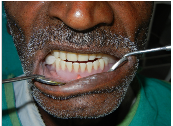
Figure 5. The intra oral view of modified mandibular advancement device.