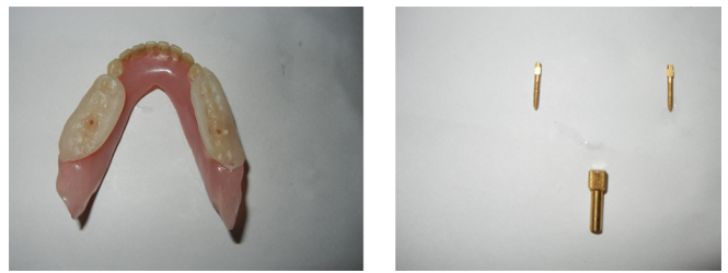
Figure 3. Mandibular denture with soft liner wafer and screw to immobilize the denture and soft liner.