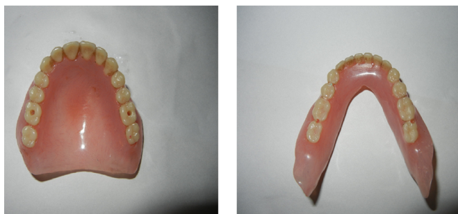
Figure 2. Complete dentures with hole at molar region.