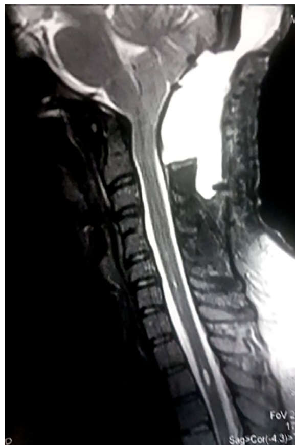
Figure 2. Sagittal T2 Cervical MRI.

Central sleep apnea is defined by cessation of airflow without respiratory effort which is due to absent or lack of ventilatory drive 1 . Syndromes that consist CSA are categorized into two groups based on wakefulness CO_2 (Hypercapnic vs. Nonhypercapnic). The causes comprise a wide variety of clinical entities ranging from physiologic central sleep apnea to high altitude, congestive heart failure, medication; medical disorders and CNS causes of decreased ventilatory drive 5 .