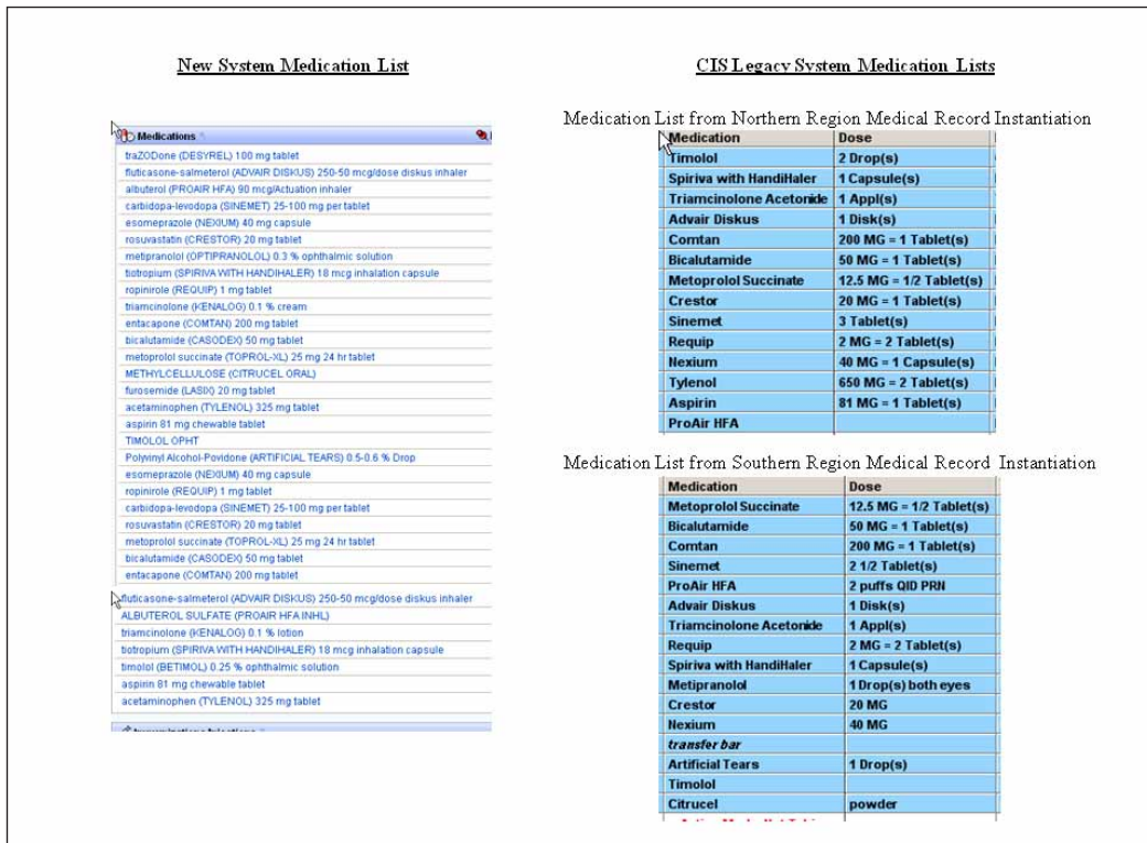
Fig. 2 CIS Legacy Medication Lists and New System Medication List