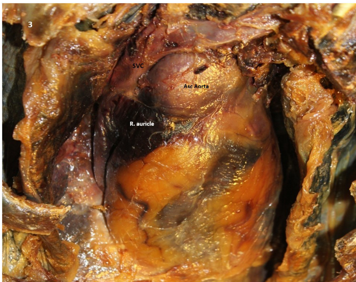
Figure 3. Heart without fibrous pericardium in a vertical position. Superior vena cava (SVC), Right auricle (R auricle), Ascending aorta (Asc Aorta).

Banneheka (2008) in a cadaveric study (106 cadavers) reported in 52% of the cases the phrenic originated from C4 and C5 and only in one case C4 segment was absent.