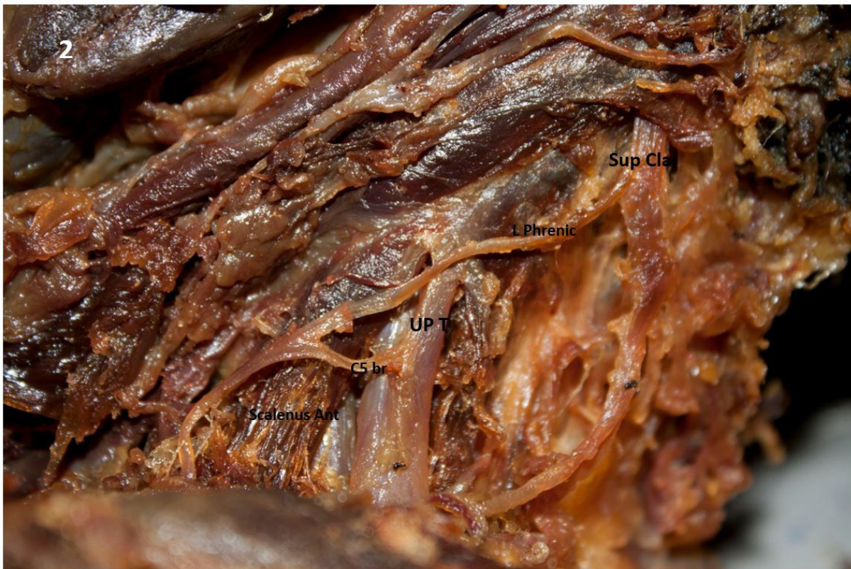
Figure 2. The left phrenic nerve ( R phrenic nerve ) originates from the supraclavicular nerve ( Sup cla ) and a branch from C5 ( C5 br ) root of the upper trunk ( UP ) of the brachial plexus. The left phrenic nerve descends in front of scalenus anterior ( scalenus ant ).