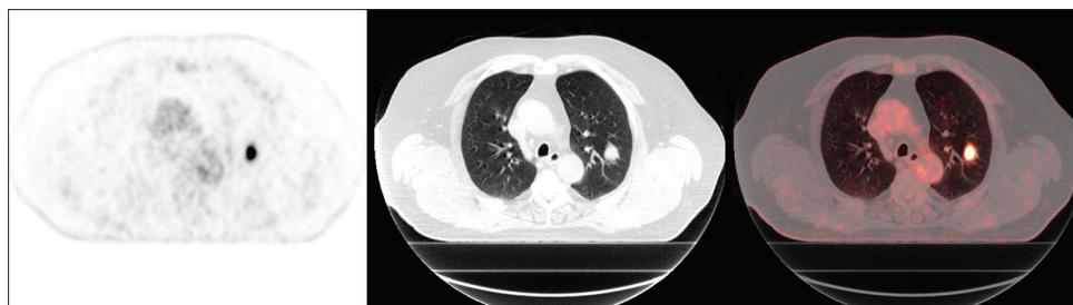
Figure 1: The 18 F-fluorodeoxyglucose positron emission tomography/computed tomography and fusion positron emission tomography/computed tomography axial slices show an intense hypermetabolism in the known nodule located in the left upper lobe with a maximum standardized uptake value of 16.6