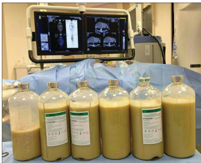
Figure 3: Five liters of purulent material was aspirated from the cyst by percutaneous drainage

Tan et al. showed that surgical drainage of hepatic abscesses greater than 5 cm showed a better clinical evolution in terms of need for re-intervention and success rate of the procedure and should be considered as the first line of therapy. [8] Although the conventional surgical approach is still considered the definitive therapy of choice, excessive manipulation of the liver in a patient with symptomatic