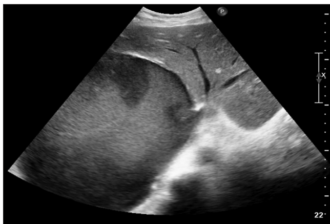
Figure 1: Upper abdomen ultrasound with giant heterogeneous cyst with thick wall in the right hepatic lobe

a longstanding asymptomatic simple hepatic cyst and a recent infection of the upper airways. His admission laboratory tests showed anemia, monocytosis, and high levels of C-reactive protein. On ultrasound [Figure 1], a giant heterogeneous cyst with thick wall was noted in the right hepatic lobe, 6 cm larger than the previously reported. A positron emission tomography-computed tomography scan [Figure 2] demonstrated high uptake (standardized uptake value = 7.6) in the wall of the cyst, suggestive of infection. After multidisciplinary discussion between the teams of interventional radiology, clinical hepatologists, and gastro-surgeons, it was opted to perform a percutaneous drainage guided by tomography, and after clinical-laboratory stabilization, it was opted to implement an elective surgical approach of the hepatic cyst.