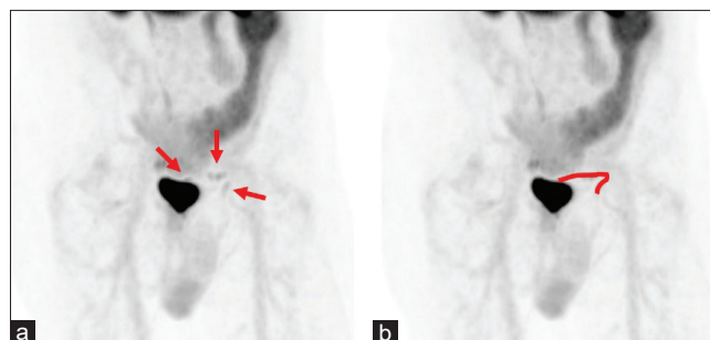
Figure 1: (a) Right anterior oblique maximum intensity projection of the pelvis from a 18 F-DCFPyL PET scan in the 71-year-old male patient with prior history of prostatectomy and previous treatment with androgen deprivation who is described in this case report. Note the curvilinear distribution of radiotracer in the left pelvis (red arrows) that outlines the expected intrapelvic course of the left vas deferens. (b) The same maximum intensity projection as in (a) but with a red line demarcating the approximate location of the intrapelvic left vas deferens

While pathologic confirmation of disease in the patient's left vas deferens is necessary to confirm the diagnosis of PCa, PSMA-targeted agents have been repeatedly shown to have exceedingly high specificities. [8,9] In addition, many of