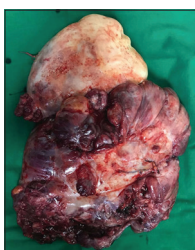
Figure 3: En Toto excision of mass with sliver of lung tissue (32 cm × 26 cm) weighing 3.8 kg