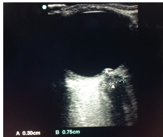
Figure 3: Ultrasonography image of optic nerve sheath diameter measurement. The figure shows the ultrasound measurement of optic nerve sheath diameter in centimetres. The caliper 'A' measures the depth (from the eyeball) at which the optic nerve sheath diameter has to be measured (3 mm). 'B' measures the optic nerve sheath diameter (7.5 mm) at this depth