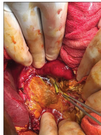
Figure 2: Duodenal perforation secondary to the migrated stent through an 8-mm laceration into the right anterior pararenal space